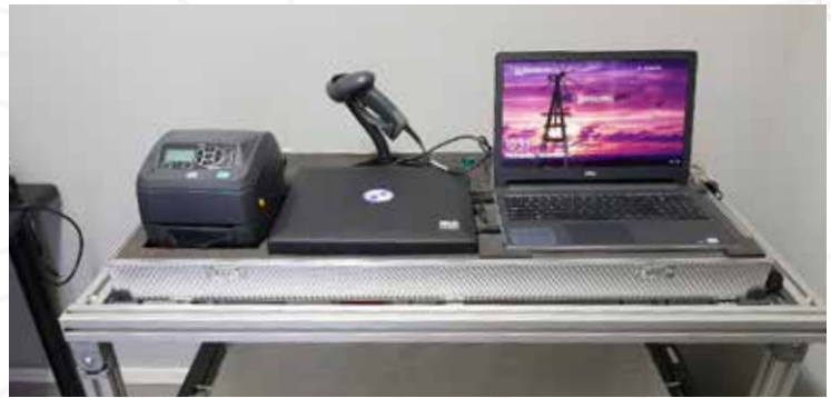
RFID system tracks the location of assets and stock