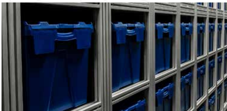
Smart Storage Range is integrated with RFID systems