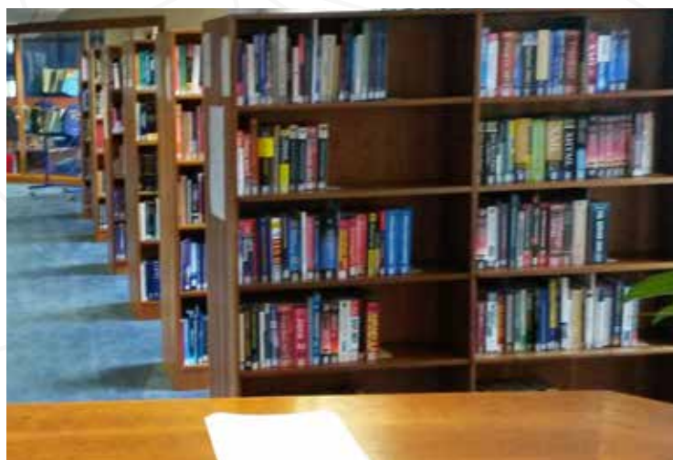
Library Information Management

Synertech's Traxsense software platform brings to life innovative, automated monitoring and tracking solutions by providing clients with dashboards and analytics to easily track all assets and to monitor business performance indicators. Smart sensor enabled assets are transformed into intelligent data sources. These smart assets are connected in real-time which provides organisations with controlled and auditable IOT information. Traxsense not only provides for immediate management decisions, it also harnesses the power of data analytics for business optimisation.